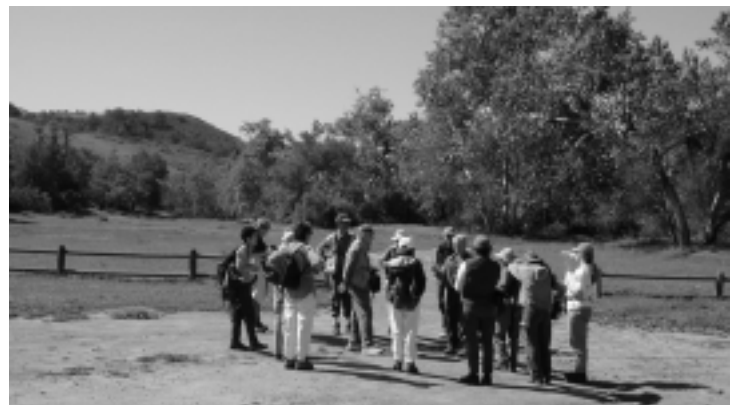
Dave Bontrager's bird class starts out on a walk.