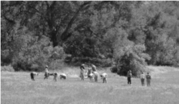
Cal State, Long Beach "field methods in ecology" class