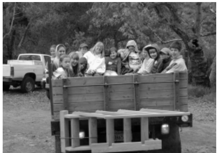
Starr Ranch Junior Biologists, School Days on their way to study insects, small mammals, and herps in different habitats.