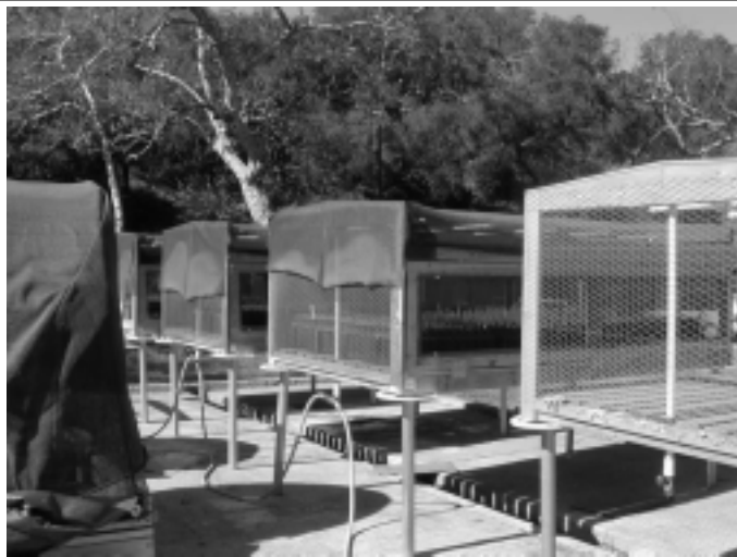
Starr Ranch homemade native plant nursery